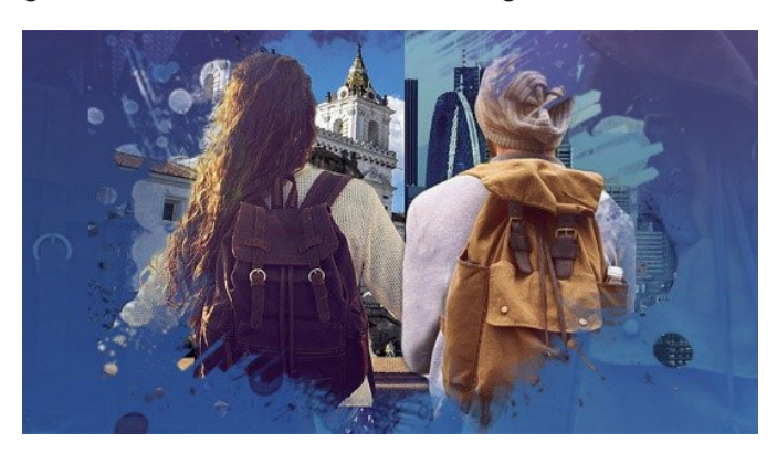
The DNA-AEFE school exchange scheme

The platform also hosted the digital gathering "24h d'Agora Monde" in April 2020, which brought together 2,000 users from Quito to Tokyo and generated more than 500 exchanges.