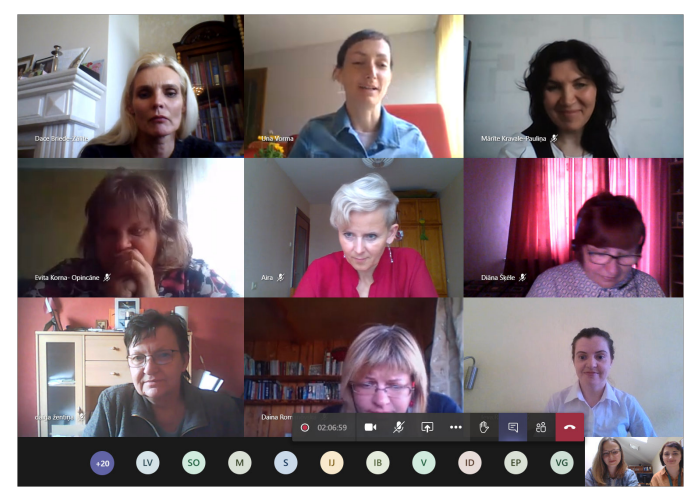
Online workshop participants

At the invitation of the International Association of Educational and Vocational Guidance to share experience on distance career support, on June 3rd, 2020 the LKAAA organized an online workshop for its members to discuss the pros and cons of remote working for guidance practitioners. More about the experience of LKAAA members at <a href="https://www.lkaaa.lv/node/224">www.lkaaa.lv/node/224</a>.